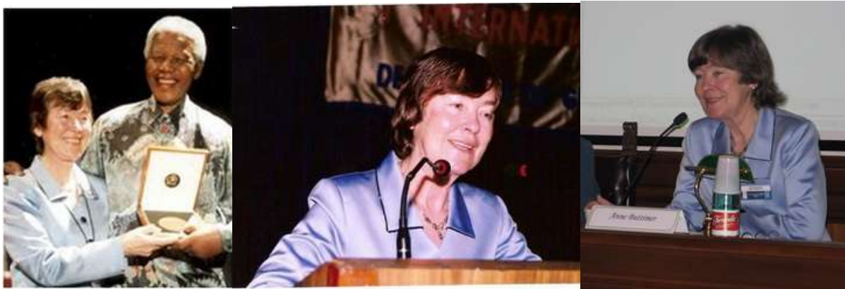
Left, 2002: Durban, Awarding Nelson Mandela Madiba; Center-right, chairing Sessions: 2005, in Hyderabad and in Rome.

taking several photos. Look at her face, she is never bored, and always expressing something: if not happiness, it is interest.